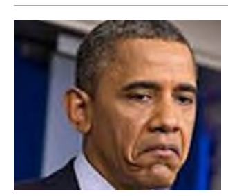
Obamacare Secret Legislation Discovered Money Morning

The #1 Exercise that Accelerates AGING (Stop Doing It!) Old School New Body