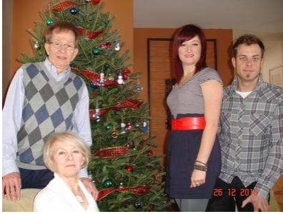
Published December 27, 2010.