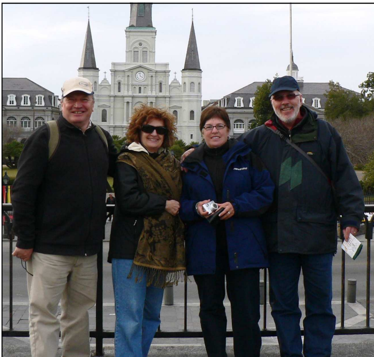
The four travellers

These events in no way tarnished this magnificent trip. There were still two and a half weeks left to enjoy!