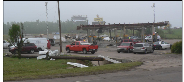
Photo of Love's Gas Station on the morning of May 11.

The alert was lifted; the sky became blue again with white clouds. We were told that nearby, just down the hill, the gas stations had been completely mowed down. We had filled our tanks at LOVE'S station barely two hours before. A few minutes later, we walked over to see the damage. While talking to the local American residents, we were told over and over again that the campers had been very lucky.